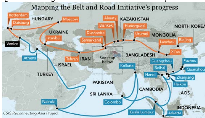
Fig. 1 The overall concept of "the Belt and Road"

The construction of "the Belt and Road" has promoted the development of foreign language talent training, and is also the main direction of my foreign language teaching. However, at this stage, the talent training mode of many colleges and universities in China is mainly to strengthen students' language skills, which is inconsistent with the requirements of China's "the Belt and Road" construction. Therefore, business English teachers in colleges and universities need to combine the needs of "the Belt and Road" construction. Develop appropriate talent training measures to cultivate more business English talents. Figure 1 below shows the overall concept of "the Belt and Road".